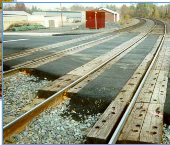
Asphalt with timbers

INNOVATIONS IN ROADWAY DESIGN AND HARDWARE ARE NEEDED TO GIVE DRIVERS A SAFER RIDE!