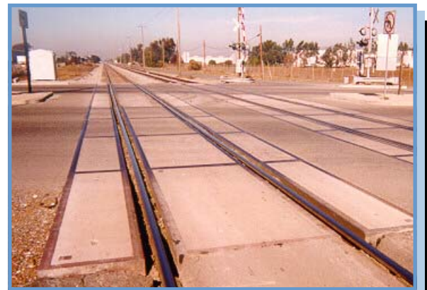
Dry precast, gray concrete. Morgan Hill, California