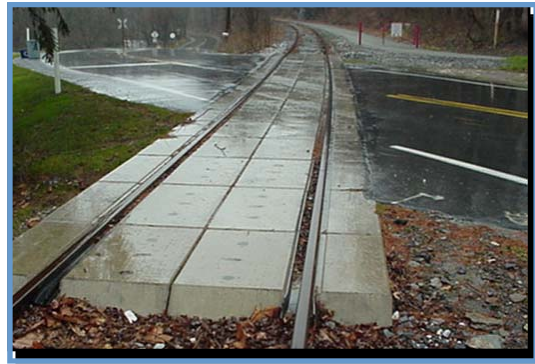
Wet precast, gray concrete. York, Pennsylvania