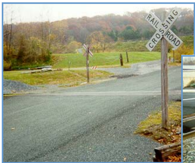
Passive rural crossing

“Each year, hundreds of fatalities are sustained at the nation's ubiquitous highway-rail grade crossings. Many are the result of drivers deliberately circumventing or otherwise purposely violating active control devices. In other cases drivers are unsure of their responsibilities because warning devices, both active and passive, are perceived by motorists as ambiguous.” (from AASHTO Strategic Highway Safety Plan approved by Board of Directors , December 1997. )