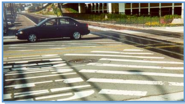
Cal Trans Crossing San Diego, CA