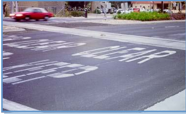
Cal Trans Crossing San Jose, CA