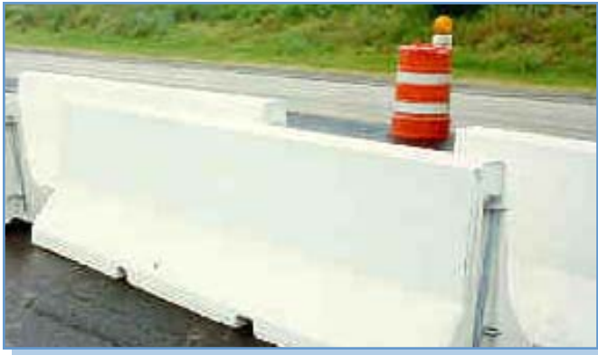
White concrete barriers for construction work zones.