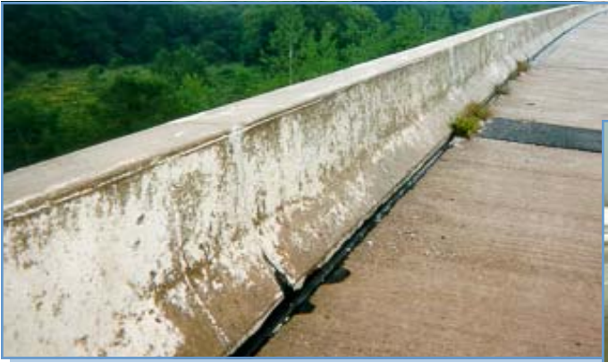
Gray concrete barrier painted white — In need of re-painting.