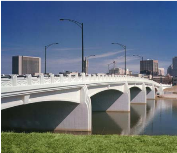
Fifth Street Bridge, Dayton, OH