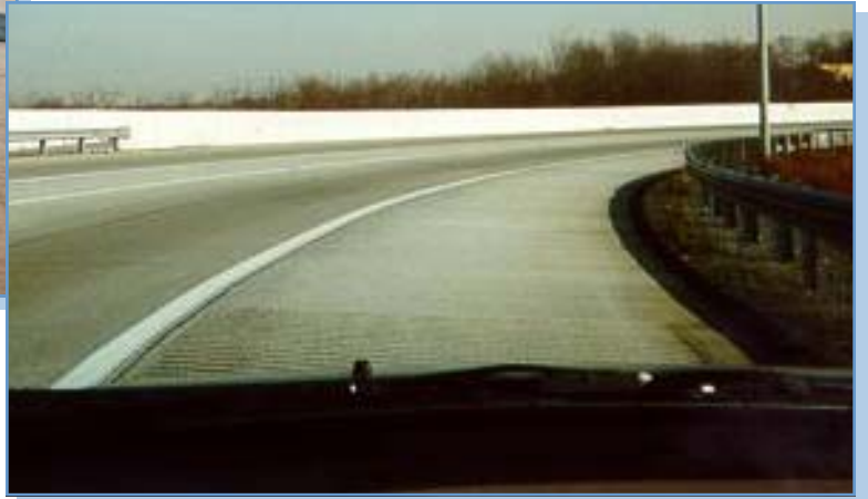
White concrete barrier—