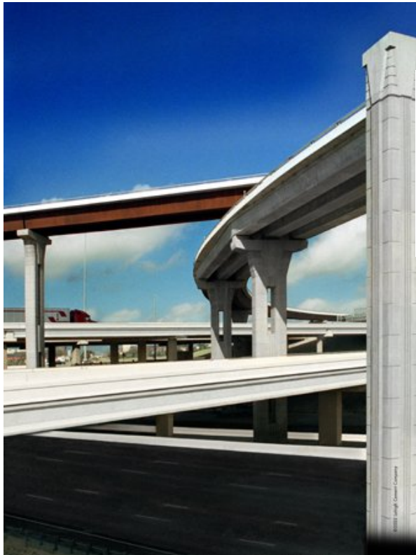
I-35 Austin, Texas