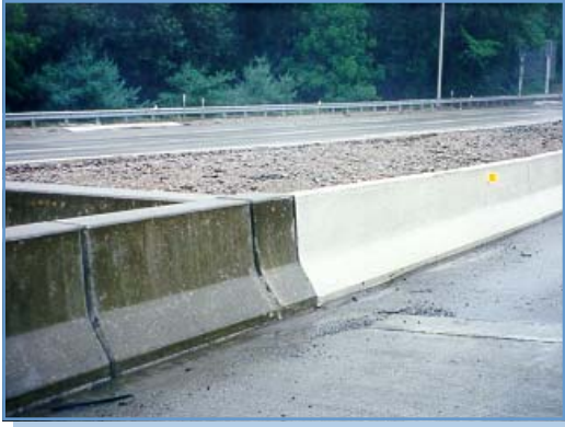
I-287 New Jersey