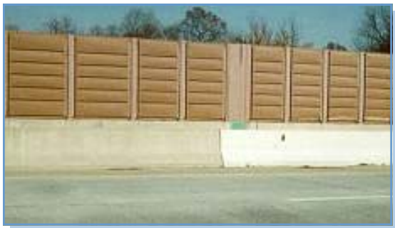
Newark Airport, Newark, New Jersey

Because of its reflectivity and visibility, the use of white concrete in median barriers and bridge parapets is increasing, making highway driving much safer for travelers, especially in inclement weather and at night.