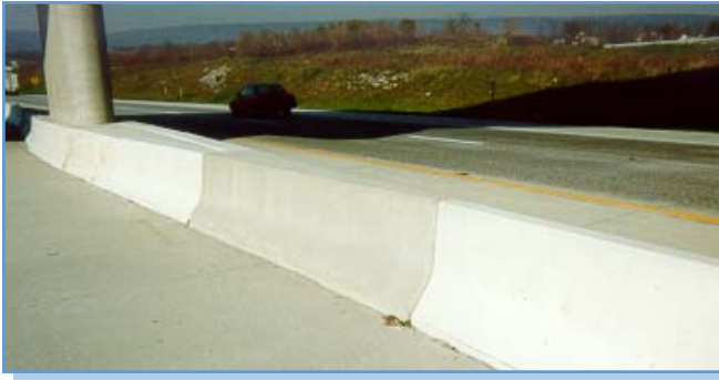
PA-581, Capital Beltway, Harrisburg, Pennsylvania