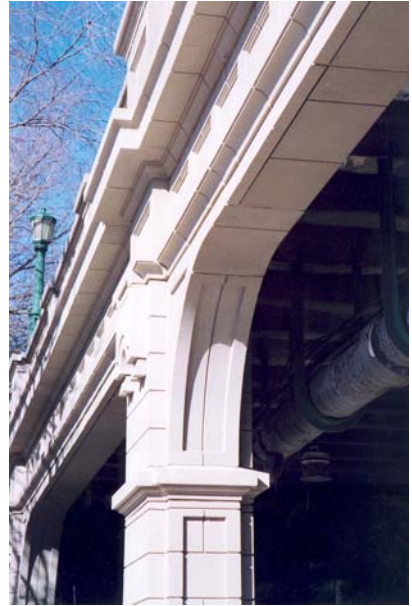
Sheridan Street Bridge, Evanston, IL