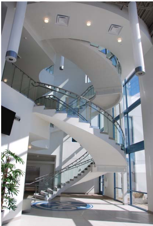
PKG CAMPUS Designer: Johnson Architects Manufacturer: Northwest Precast