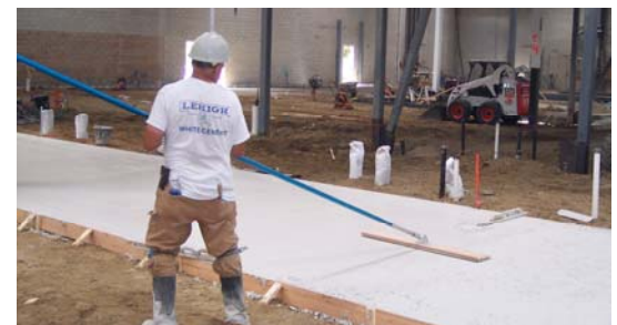
WinCo Foods Supermarkets Placement by: Meidling Concrete Inc.

Lehigh White Cement Company 7660 Imperial Way, Allentown, PA 18195 e-mail: info@lehighwhitecement.com www.lehighwhitecement.com