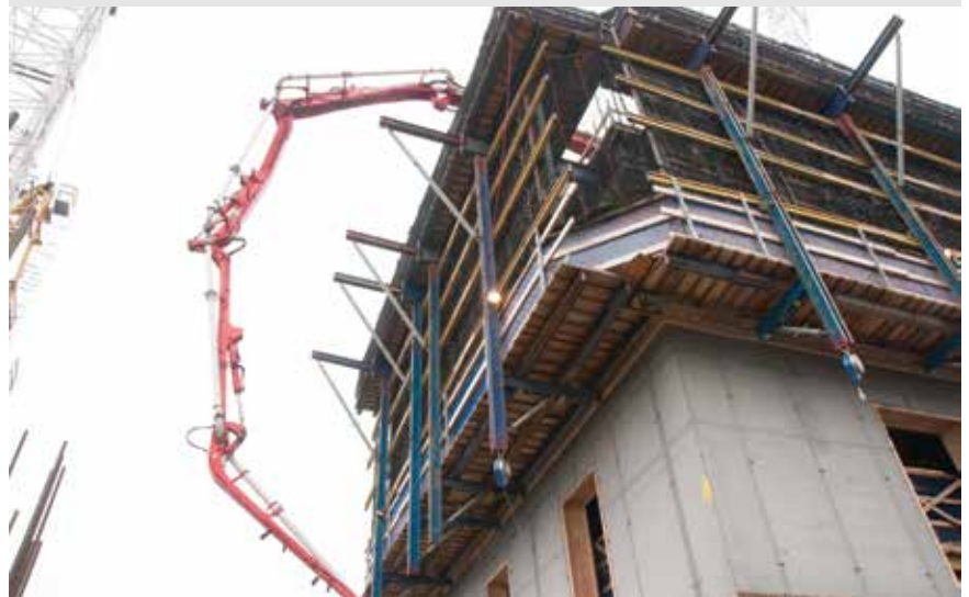
By pressing a button R&S certified staff move the core forms, temporary steps, the placing boom, and a 6-ton crane 16-feet upward to start construction at the next level.

Chemical admixture performance is closely related to cement chemistry, especially to the C_3A content, which can vary significantly between any given cements. Knowledge of cement chemistry and admixture interaction allows ready-mix producers, manufacturer representatives, and admixture experts to work together to produce concrete mixes that meet project requirements. Early involvement is critical.