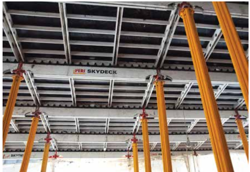
R&S uses PERI's hand-set "drophead" floor forming system, allows workers to safely set them in place from below.

There are several buildings in the world taller than 432 Park Ave but it's thought to be the tallest all-residential structure in the world and the second tallest building in the U.S., behind the Willis Tower in Chicago. The design is sleek and attractive, the construction and engineering are state-of-the-art, and its occupants will enjoy living in a safe, energy efficient environment. ■