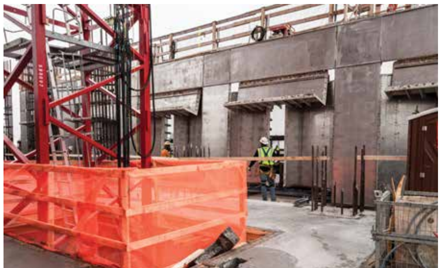
Stainless steel-hinge forms for the architectural column and spandrel beams are attached to the self-climbing scaffold system and move with the scaffold.