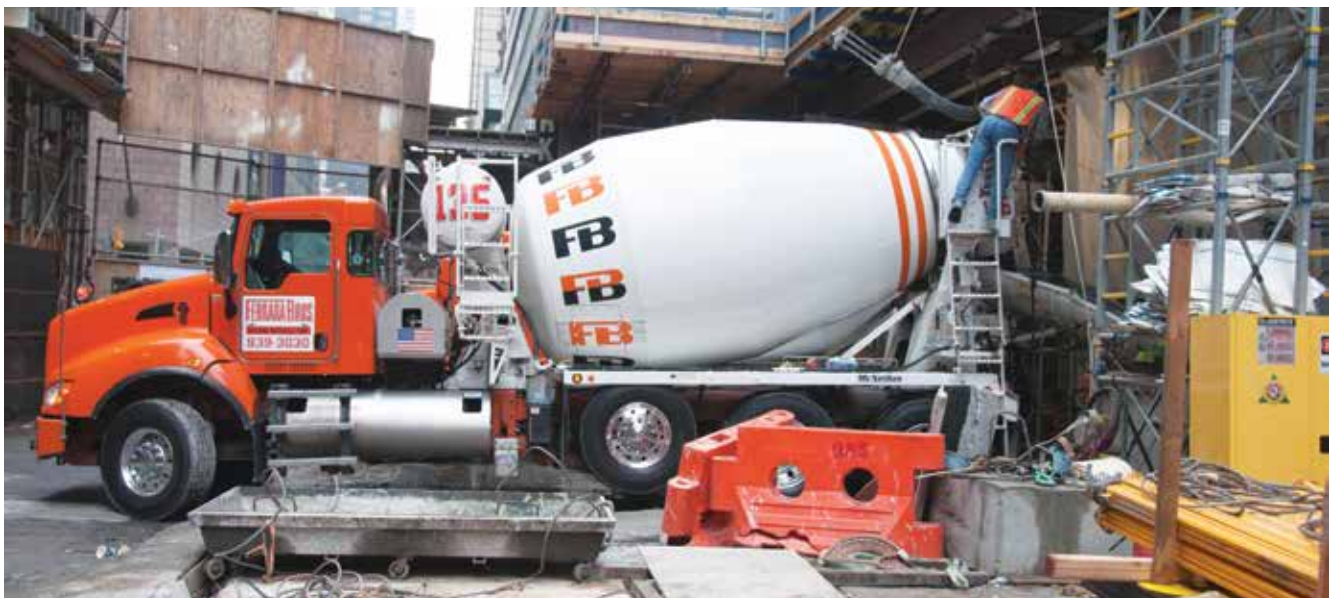
The requirements for the concrete mixes are challenging. Ferrara Brothers deliver pumpable SCC mixes that will eventually be pumped 1,300 feet straight up.